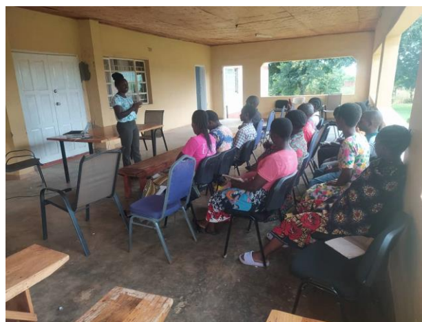
Mwaiwathu farmers' club members during VSL training session