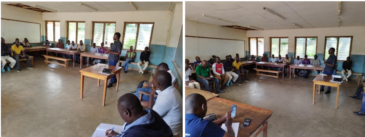
Meeting with Chakhaza ADC members

The Chakhaza ADC expressed appreciation for the ongoing agricultural projects and their alignment with community needs. The meeting successfully reinforced the importance of partnership between OCA and Chakhaza ADC in achieving sustainable agricultural development. The ADC committed to supporting community mobilization and ensuring that OCA programs reach the intended beneficiaries effectively.