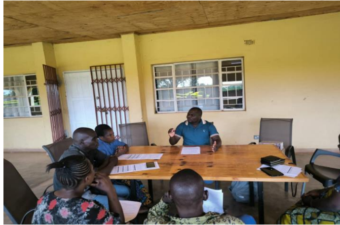
A section of participants during review meeting with Area Mechanics