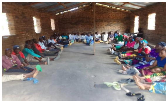
Participants attending the training at GVH M'biya

After conducting the participants verification activities, all the qualified participants had to undergo nursery preparation training. Therefore, with support from Ngara Forest Plantation Manager the identified participants were trained on the aforementioned topic. The training involved tree nursery preparation and management at Nambola primary school and M'biya catholic church to cover for all the villages.