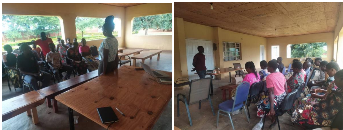
Farm club members being trained on VSL

A total of 15 farm club members participated in the training whereby members showed high levels of interest, actively engaging in discussion and exercises. The training opened members' minds on better ways of managing money and supporting one another financially. Through the training, Mwayiwathu club members successfully formed a VSL group and agreed to begin weekly savings meetings.