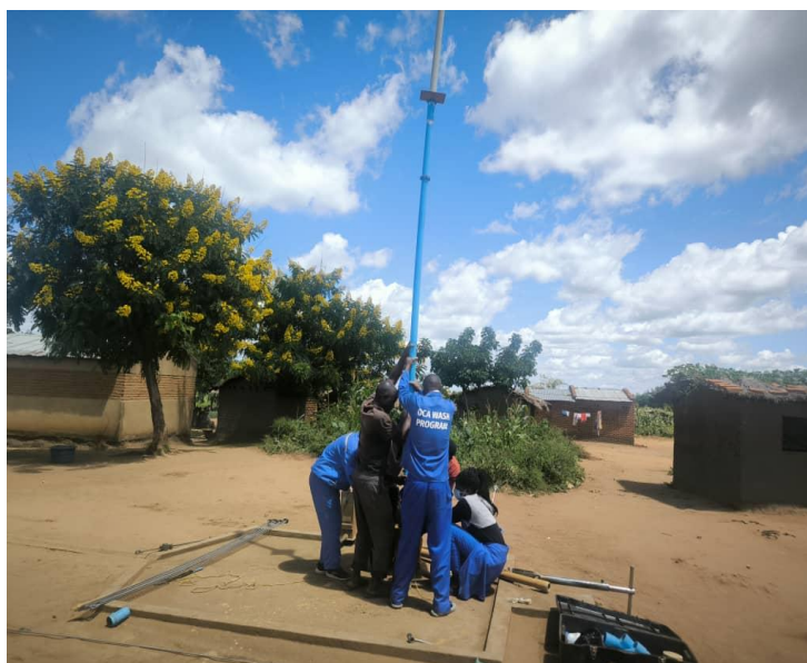
Water well repairs in progress