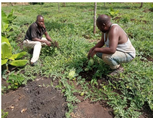
Madzimayela irrigation club working on watermelon production