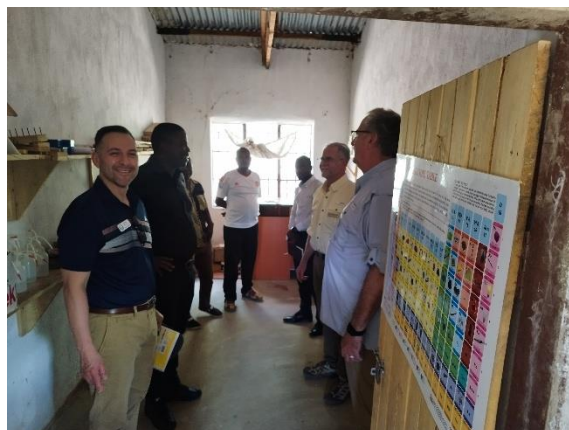
OCA visit at Ngala CDSS library (Left) & Laboratory room (Right)