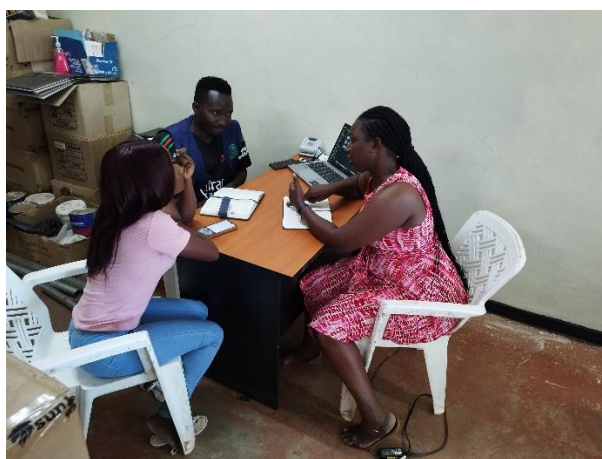
OCA having a meeting with Opulence Malawi

The Orant Education program met with Opulence Malawi at their office in Madisi to discuss book sharing opportunities. The meeting aimed to explore ways for both organizations to collaborate on distributing books donated to Orant by Peachtree Tubepoka Legacies. These non-curriculum books are designed for secondary students to use as reference and expand their knowledge. Given our partnership and Opulence's community library at Ntanila primary school in Madisi, we planned a book-sharing initiative to benefit both organizations.