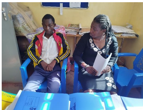
OCA having a good time with Dowa sec.school (Left) & St. Peter's Sec School (Right)