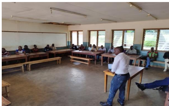
EEPM presents the program to ADC

so far. This will help the program to receive full community support as the ADC is the gatekeeper for all the developments around the catchment the program is being implemented. The ADC supported the initiative of registering our availability which led them to ask more questions about the program for clarifications which were responded to during the meeting. However, the ADC also requested Orant Charities Africa if there can be a chance of extending OCA activities to other areas within Chakhaza B boundary.