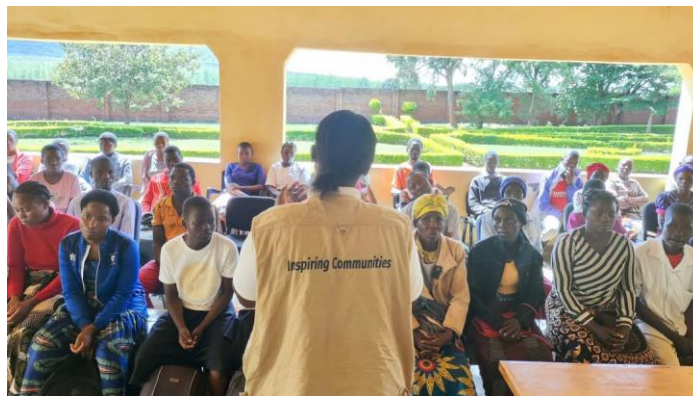
Meeting with parents in progress

The Orant Education program convened a review meeting with parents and students; fostering a strong collaboration with parents and students to enhance students' educational experiences. We encourage parents to actively support their children's studies, ensuring they reap the benefit of education. The review meeting was attended by 66 participants. We also covered student's performances, behaviors and strategies to further improve the education program. Everyone participated and we were able to share one's views and opinions.