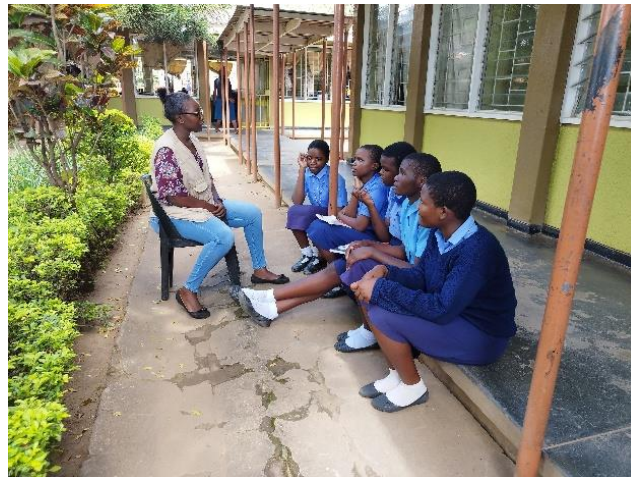
OCA mentoring students at Lilongwe Girls

The Education program also toured 3 secondary schools; St. Peter's Secondary School, Dowa Secondary School and Lilongwe Girls Secondary School. During the reporting period, we monitored our sponsored students during the term break. We provided mentorship to the students to encourage them to put extra effort academically and maintain good behavior at their specific schools.