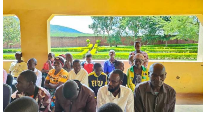
Review meeting with parents and students at OCA veranda