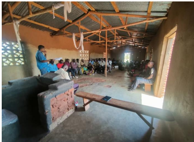
Quarterly review meeting for Kabuluzi Piped Water Project

On the environmental side, there is still a lot to be done to conserve the environment. The members agreed to leverage initiatives by the OCA Energy and Environmental program such as planting of trees and using Nkhuni pang'ono stoves to ensure environmental sustainability.