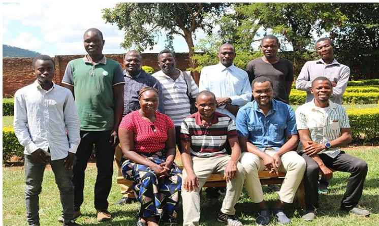
A group photo of participants after a review meeting for Sanitation Entrepreneurs

The WASH program implements all its initiatives in collaboration with different stakeholders. One of the key stakeholders in the promotion of sanitation are Sanitation Entrepreneurs or sometimes referred to as Sanitation promoters. Sanitation Entrepreneurs are responsible for the construction of durable low-cost Corbelled latrines and Pit latrine slabs for community members at an agreed price. During the review it was revealed that only 4 corbelled pit latrines were constructed in the first quarter of the year. Similarly, only 3 slabs were constructed in the same period. This low adoption rate of corbelled latrines and slabs was attributed to the rainy season and the lean period in