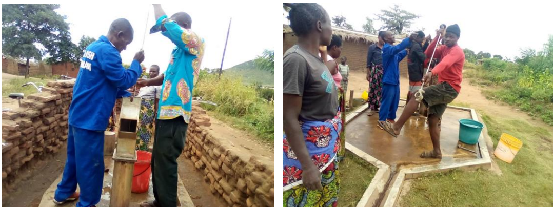
Preventive maintenance sessions in Chapuwala and Samba village (Left to Right) during the month