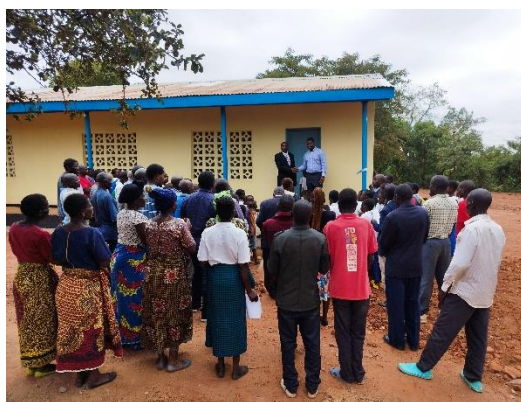
Opening ceremony for a renovated school block at Kabuluzi primary school