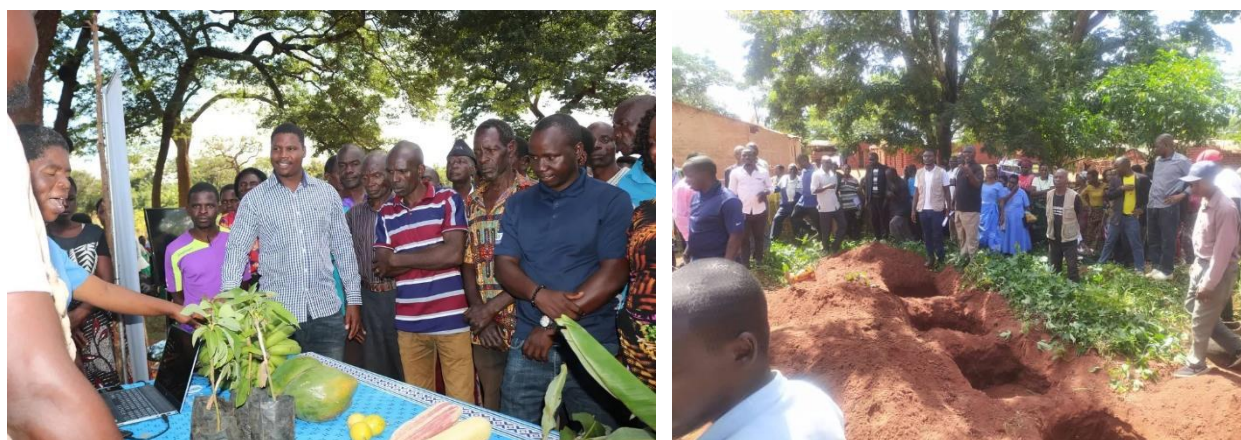
Farmers attending to field day

The activities involved during the field day include field tours showcasing agroecological farm using compost, crop rotation and intercropping techniques. Other seed companies such as Bayer and Seed-Co demonstrated improved maize varieties including drought tolerant and early maturity types. Through the field day, farmers gained practical knowledge on implementing agroecology to boost productivity while preserving the environment. Many farmers expressed a desire to adopt these practices.