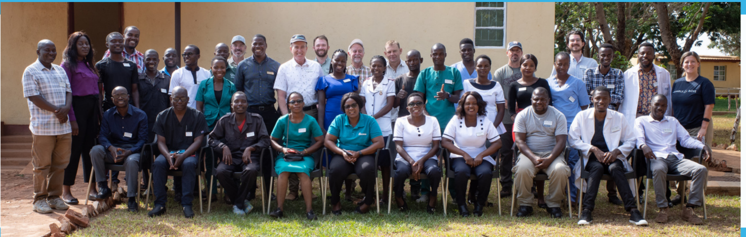
Orant staff together in 2022